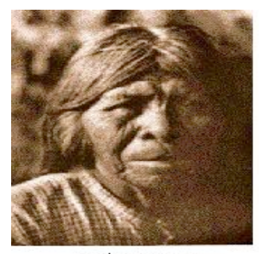
A Yokut Woman