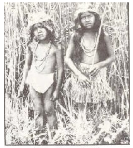
Yokut boy and girl