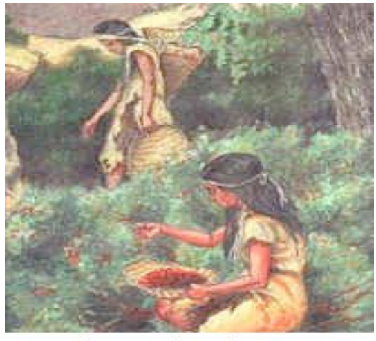
Yokut people gathering